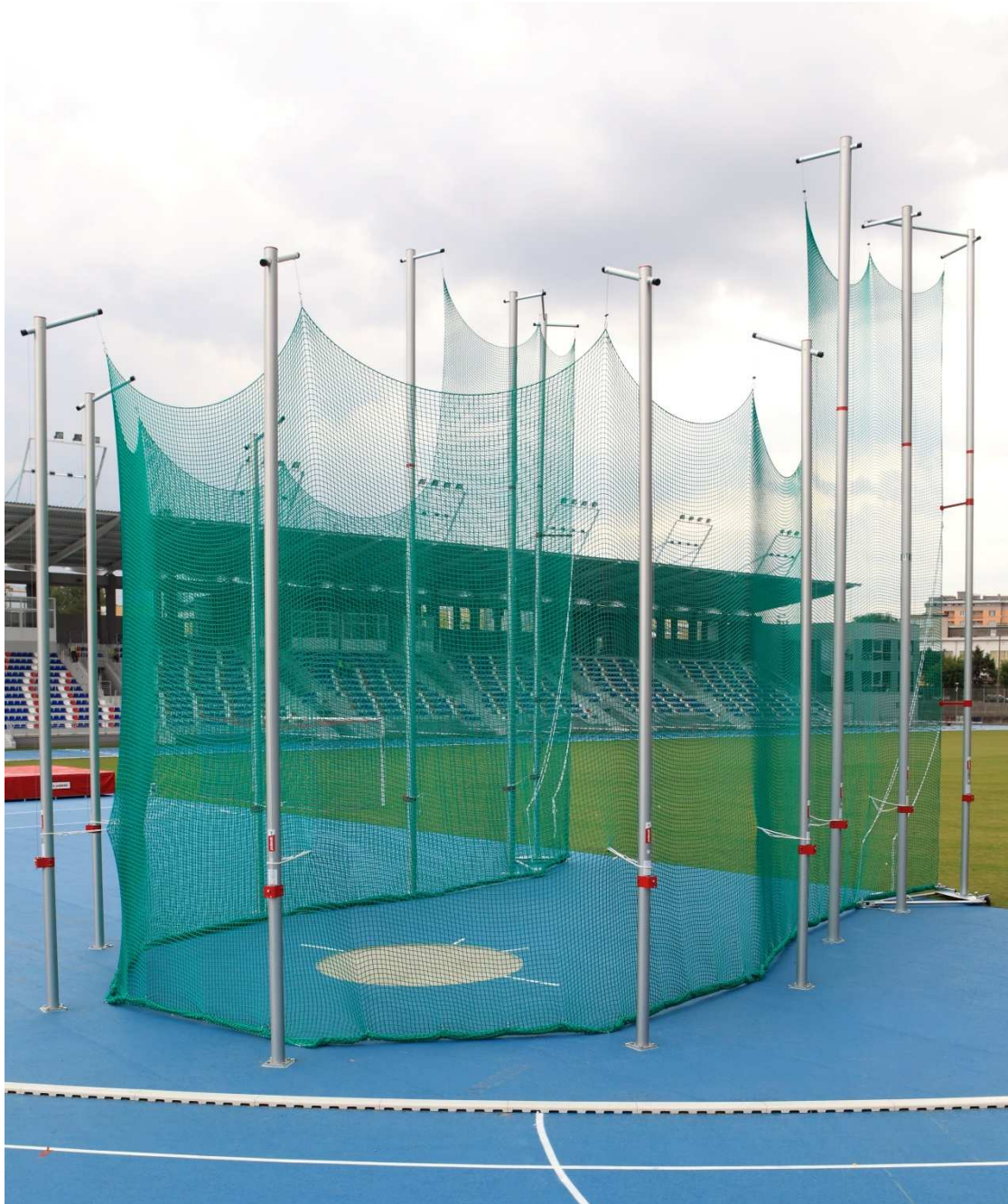
KLM-7/10-A © 2016 Polanik

The producer reserves the right to introduce without warning changes in product constructions and colours.