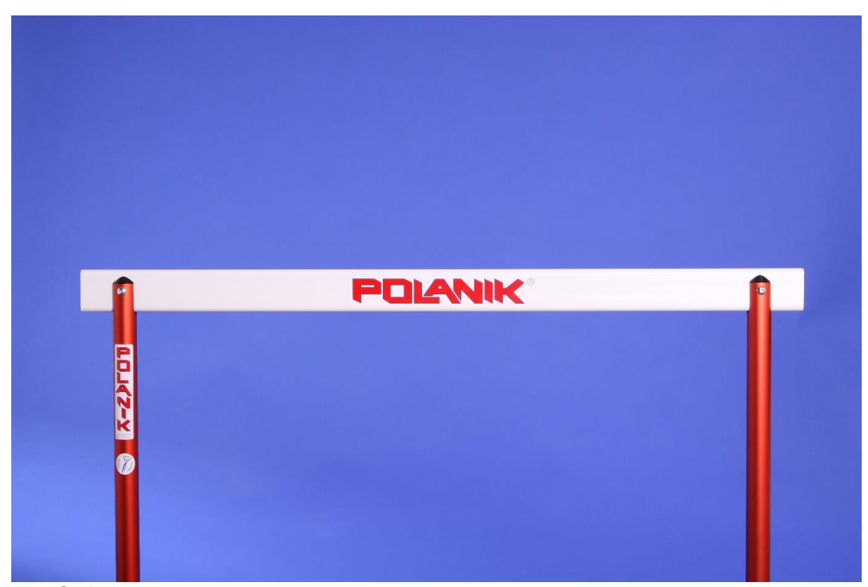
TB-018 © Polanik 2016

The product is packed in foil and a carton box.