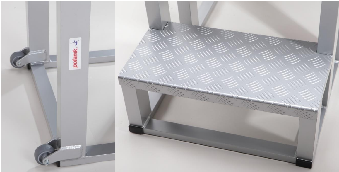
PBS17-03 © 2018 Polanik

The producer reserves the right to introduce without warning changes in product constructions and colours.