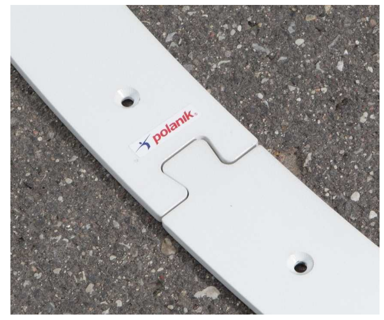
DCSM14-2135 @ 2014 \ Polanik \\ The producer reserves the right to introduce without warning changes in product constructions and colours.