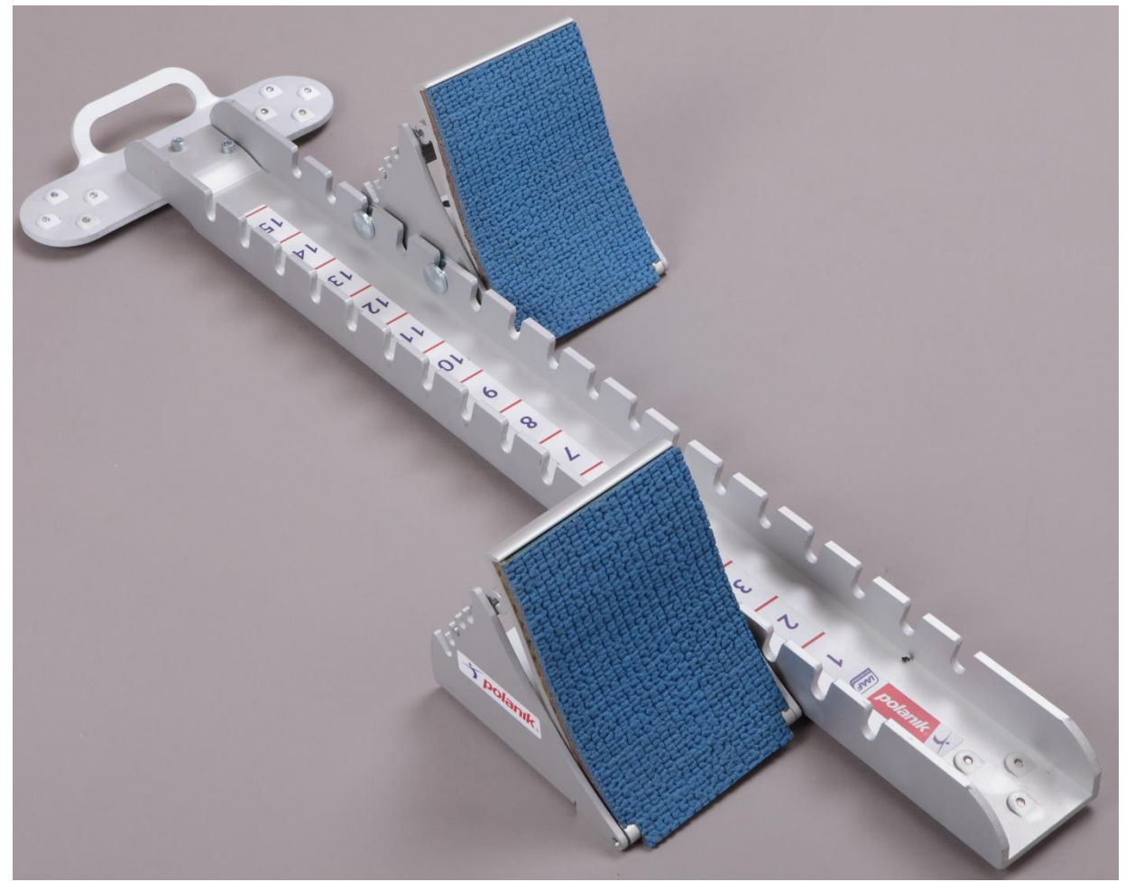
PBS17-02 © 2018

The producer reserves the right to introduce without warning changes in product constructions and colours.