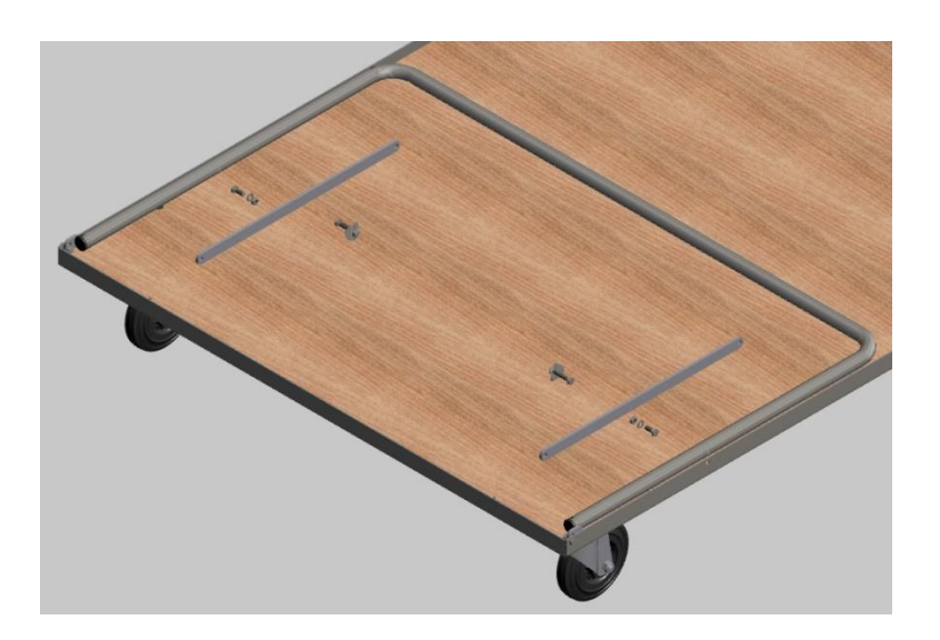
Screw down all screws only with hand first. Then tighten them with wrench until you feel considerable resistance.

The cart is delivered wholly assembled. After unpacking the cart, its handle should be put in a upright position, and supporting arms are to be installed with included screws.