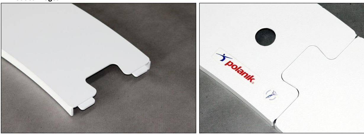
HCC-2135 © 2018

The producer reserves the right to introduce without warning changes in product constructions and colours.