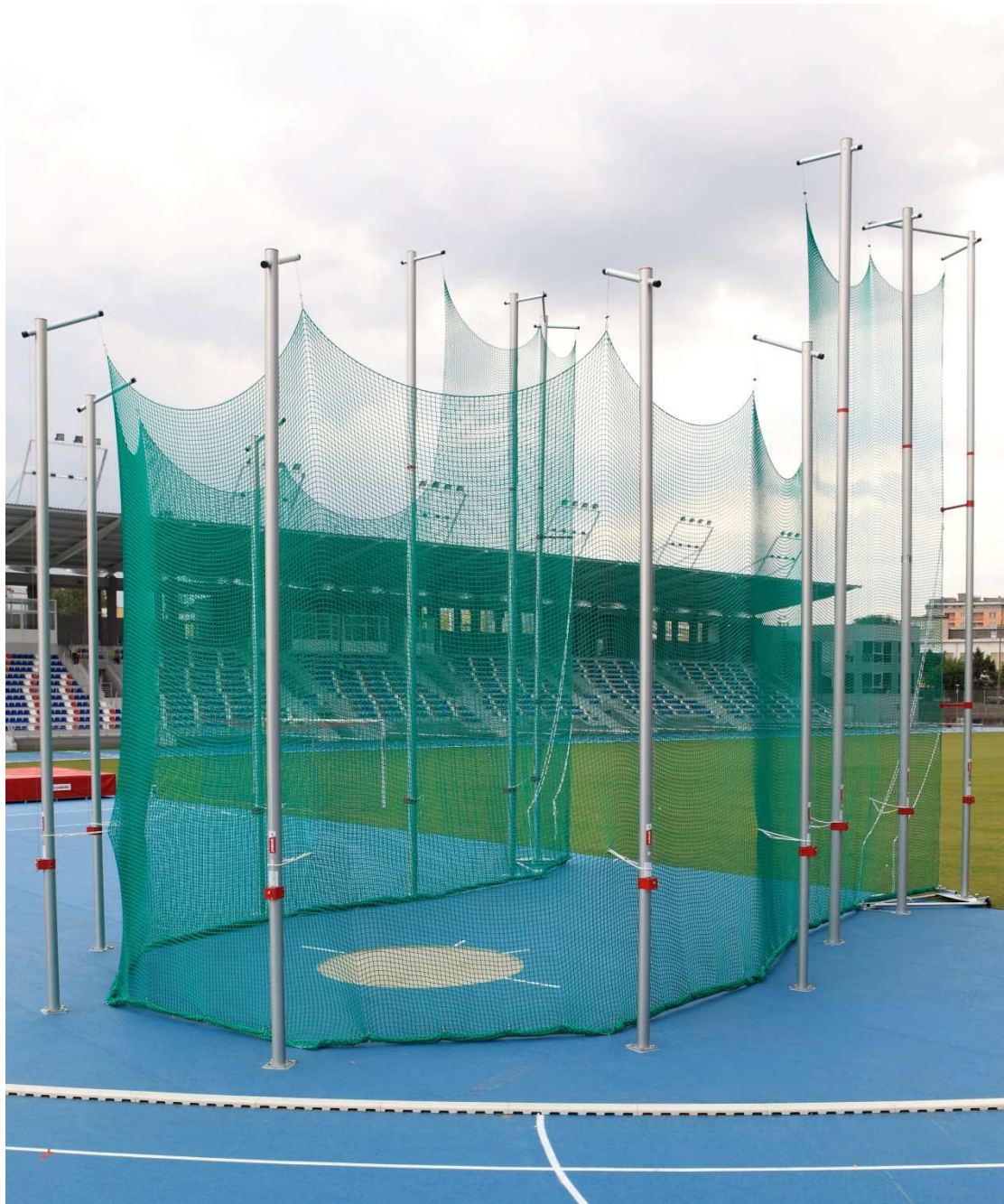
KLM-7/10-A © 2020 Polanik

The producer reserves the right to introduce without warning changes in product constructions and colours.